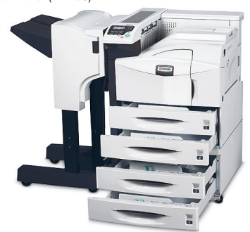
Paper feeder (PF-700)

Product depicted includes optional extras